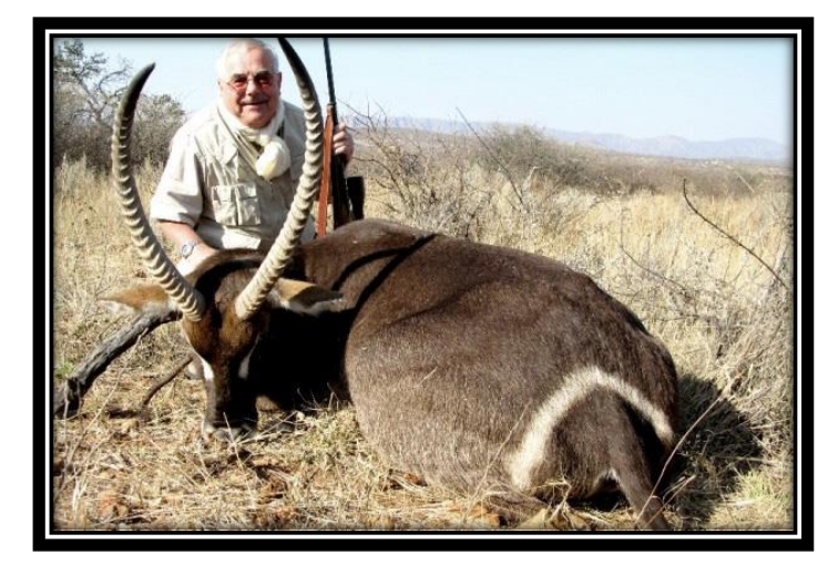
Page 4 Revised 11/17/21